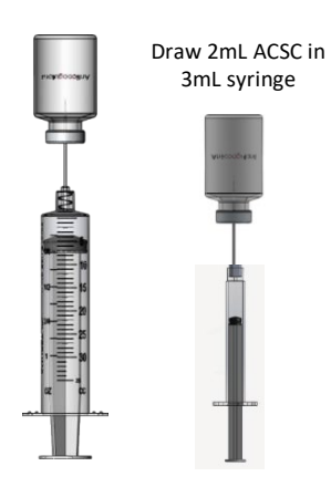
Draw 3mL of Anticoagulant Sodium Citrate into 30mL syringe