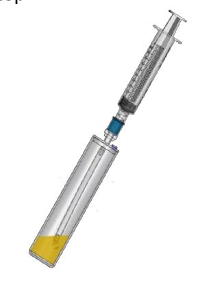
Tilt to immerse the Aspirating Pipe into the PurePRP®